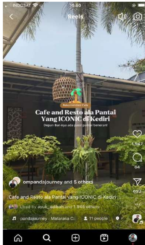
Figure 4. Matarasa Café and Resto's advertisement video content

The image above is a snippet from an Instagram video advertisement with the account @matarasacafe located on Jln. Erlangga no. 132, Katang, Kediri Regency. Product variants, price list, and location atmosphere are information that can be obtained from the video advertisement, where the location atmosphere is the main content of the video advertisement. The video, which was posted on December 2 2023, has received 1,947 likes, 64 comments from the audience and 692 shares by the end of January 2024. Some of the comments given by the audience on the video varied as follows: