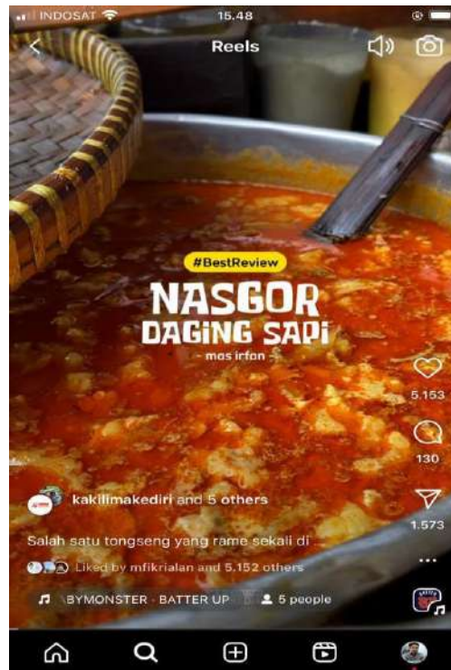
Figure 2. Nasgor Daging Sapi Mas Irfan's advertisement video content

The image from the video above shows an advertisement for the culinary Nasi Goreng Sapi Mas Irfan which is located on Jln. Kartini 71 Gurah, Kediri. The video advertisement uploaded on December 8 until the end of January 2024 has 5,152 likes, 130 comments and 1,573 shares. Apart from the location, the video also contains information about prices, product variants, location atmosphere and models enjoying the culinary dishes. There are also very diverse comments from the public, dominated by interest in visiting it, as well as reviews of experiences about visitors who have visited it, such as the comments below: