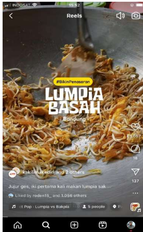
Figure 6. Lumpia Basah Bandung's advertisement video content

The image above is an image from the Lumpia Basah Bandung advertising video advertised on the Instagram account @kulinerkediri.id. Lumpia Basah which is located on Jln. KH Wahid Hasyim, Mojoroto Kediri City or in front of Pasar Bandar Kediri was posted on December 27 2023 and as of the end of January 2024 had received 1,057 likes, 18 comments and 137 shares. Apart from price and location, product texture images are the main content of the video. There are also comments from the public that are very diverse, such as reviews, interest and invitations to friends to buy the product.