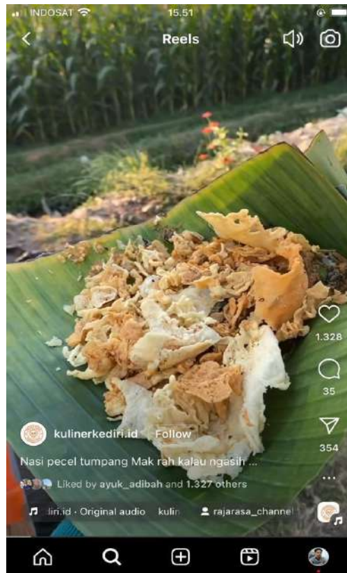
Figure 5. Pecel Mak Rah's advertisement video content

The image above is an image from the Pecel Mak Rah Instagram advertising video on the @kulinerkediri.id account. The pecel stall, which is located in Wonotengah Purwoasri, Kediri Regency, was uploaded on December 19 2023 and by the end of January 2024 had received 1,328 likes, 35 comments and 354 shares. The video contains information about the location, prices and atmosphere of the location, where the atmosphere of the location which seems very natural is the main content of the video. Comments from the audience are very diverse, including reviews from those who have visited it to those who are interested in visiting it.