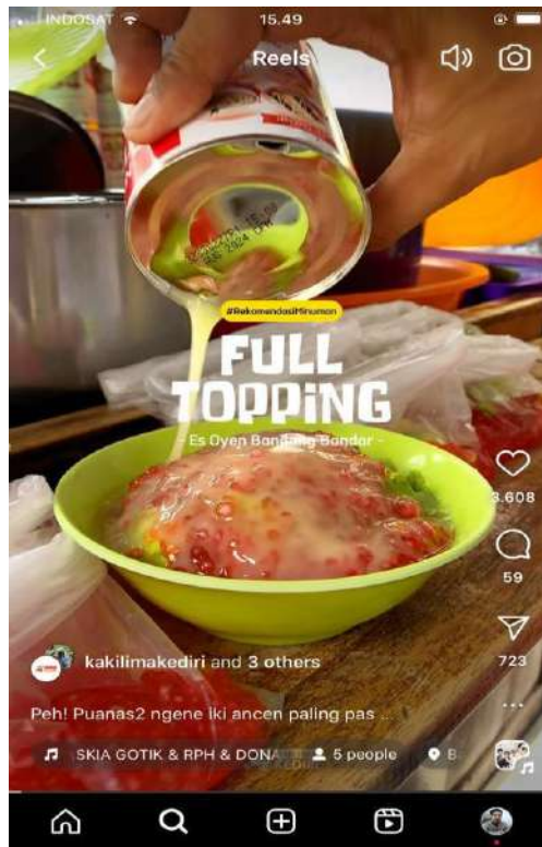
Figure 3. Es Oyen Bandung Bandar's advertisement video content

The image from the video shows an advertisement for Es Oyen Bandung Bandar culinary which is on Jln. Wahid Hasyim, Bandar Lor Kediri with Instagram account . Apart from providing information about product variants, prices and location atmosphere, these video advertisements also emphasize the visual appeal of the products offered. This is demonstrated by a visual video that shows the product texture in more detail with a model enjoying the dish. Uploaded on December 22 2023, the video has received 3,608 likes, 59 comments and 723 shares by the end of January 2024. Various public comments on the video are dominated by interest in visiting and consumer testimonials, such as the comments below: